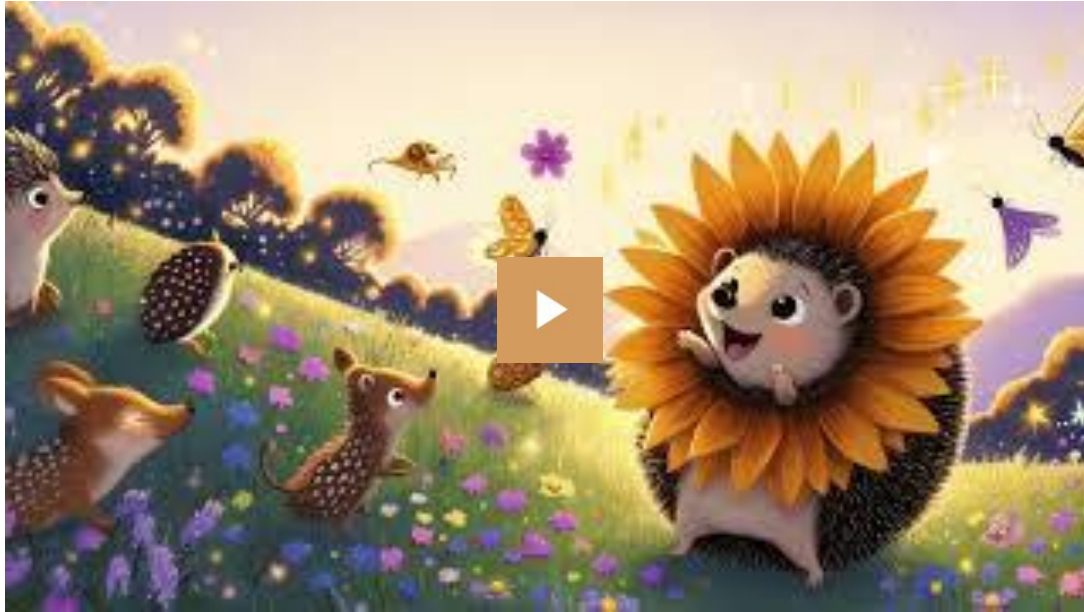
Image generation with Dall-E